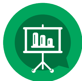
Training Mats Flip Chart