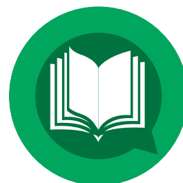
Materials for Distribution